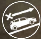
HILL LAUNCH ASSIST