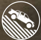
HILL DESCENT CONTROL